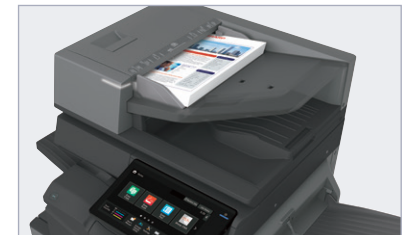
High capacity 300-sheet DSPF scans documents at up to 280 images per minute.