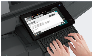
Built-in retractable keyboard simplifies email address and subject line entries.