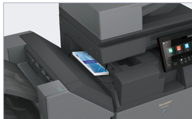
New Inner Folding Unit option offers a variety of fold patterns, including tri-fold, z-fold and others.